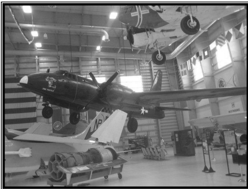
The Truculent Turtle in the National Naval Aviation Museum in Pensacola, Florida