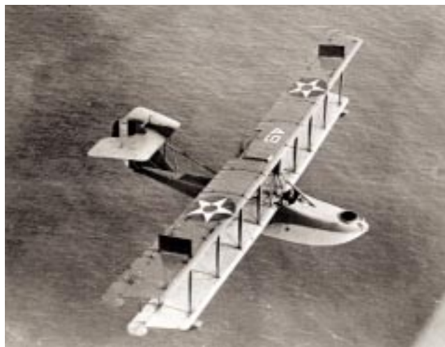
An HS-2 in flight.