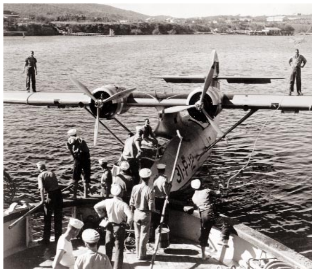
A squadron PBY being serviced by a tender.