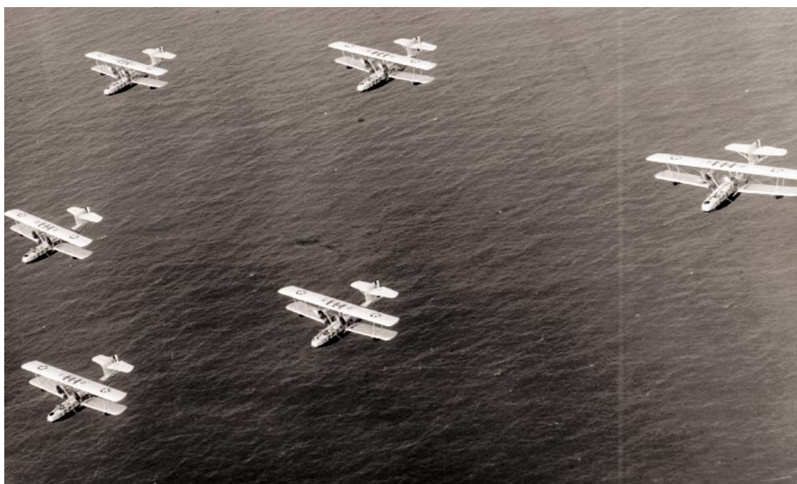
A formation of squadron PD-1s in flight, circa 1930.

1 Apr 1933: VP-2S was redesignated VP-2F, with the F representing the Base Force. A detachment of nine aircraft operated with Wright (AV 1), with remainder of squadron based at NAS San Diego.