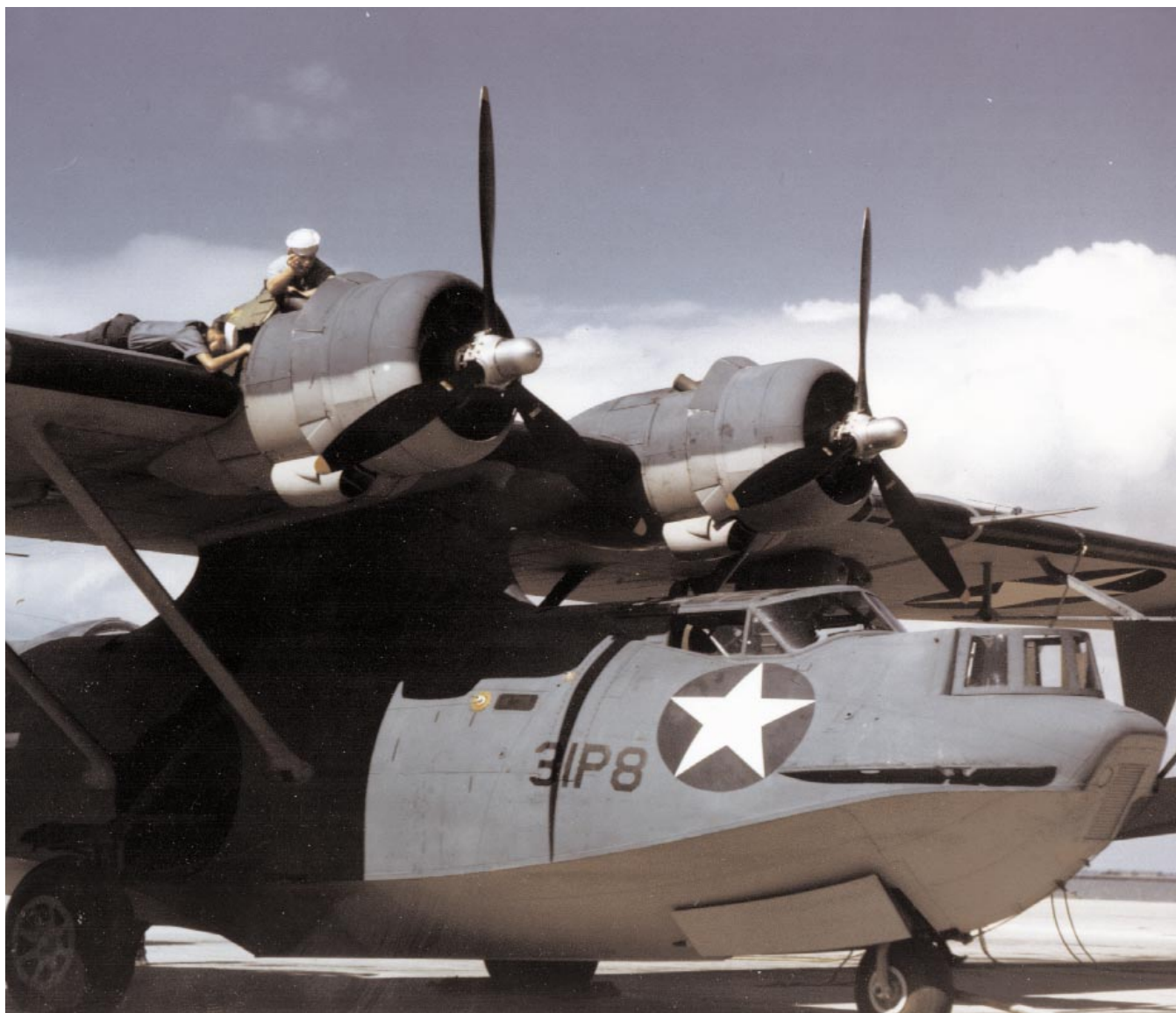
Squadron aviation machinist's mates work on the starboard engine of their PBY-5A, circa 1942, 80-G-K-15310.

1 Oct 1942: A VP-31 detachment was sent to NAS Quonset Point, R.I., to serve with the Narraganset Air Patrol off the northeastern United States. The remain-