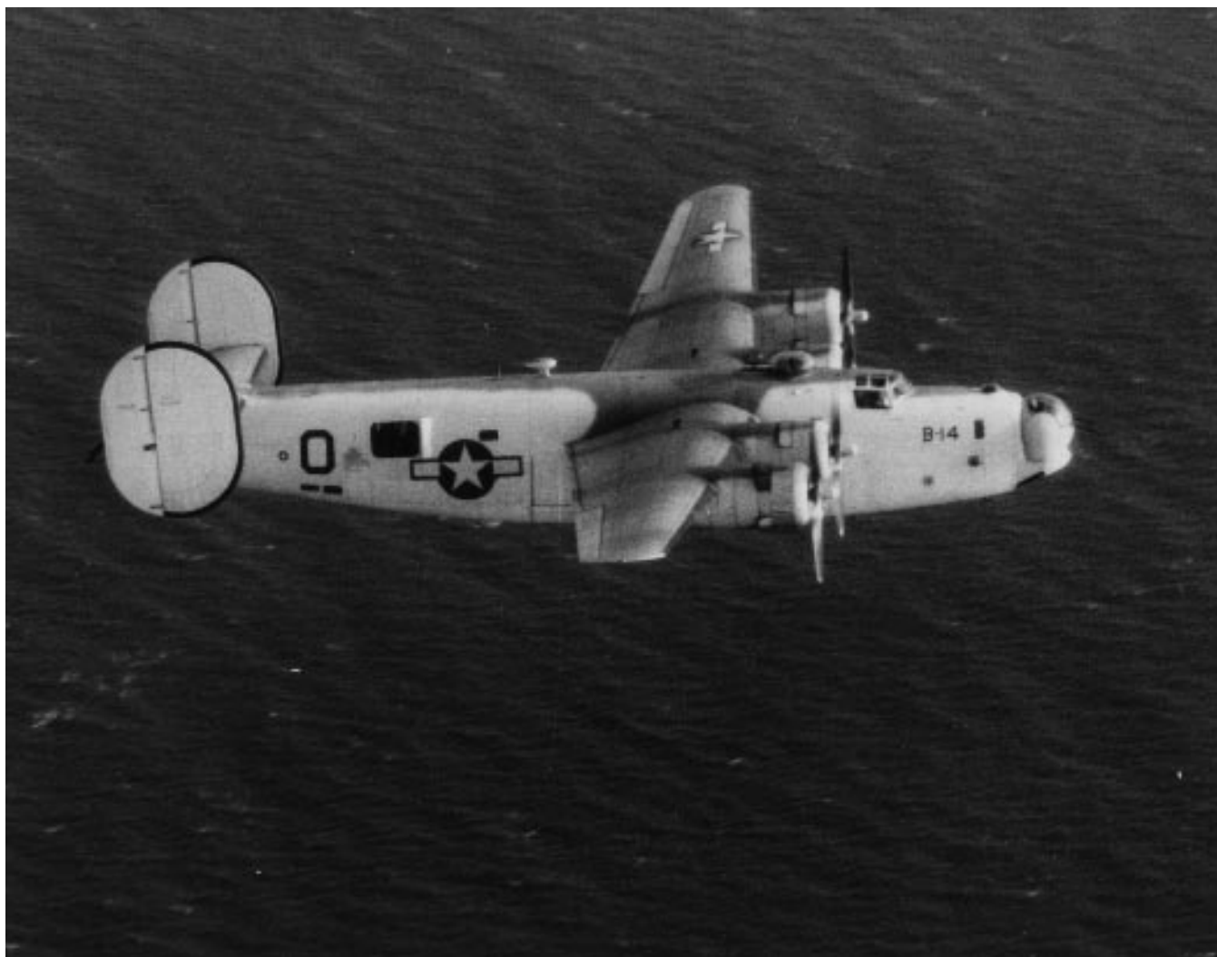
A squadron PB4Y-1 on patrol, September 1944, 80-G-282243 (Courtesy Captain Jerry Mason, USN).

1 Sep 1945: The squadron had been scheduled for reforming at NAS Seattle, Wash., as a PB4Y-2 Privateer squadron on 15 September. The cessation of hostilities and subsequent surrender of Japan ended the necessity for the continued existence of large numbers of Navy patrol squadrons. VPB-110 personnel were given new orders for either demobilization or extension of duty, and on 1 September 1945 the squadron was disestablished at NAS Seattle, Wash.