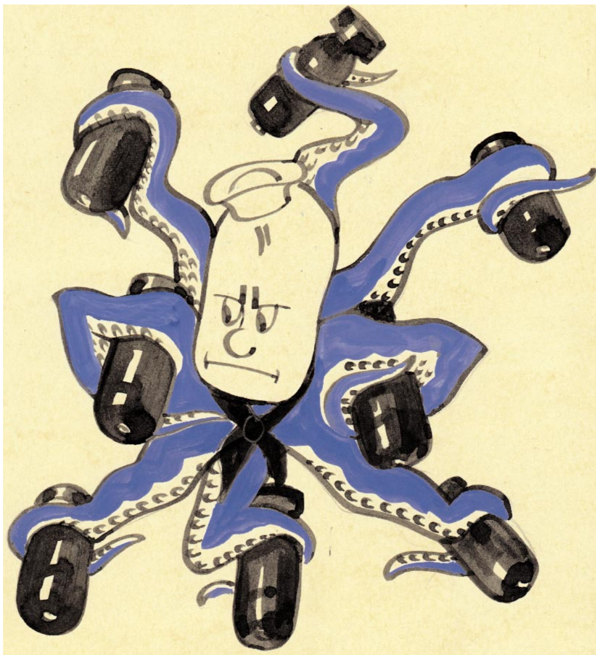
The squadron's octopus insignia design.

18 Aug–Dec 1943: VB-113 was established at NAAS Oceana, Va., under the operational control of FAW-5, as a heavy bombing squadron flying the PB4Y-1 Liberator. During the squadron’s first few months of existence its personnel received ground training using