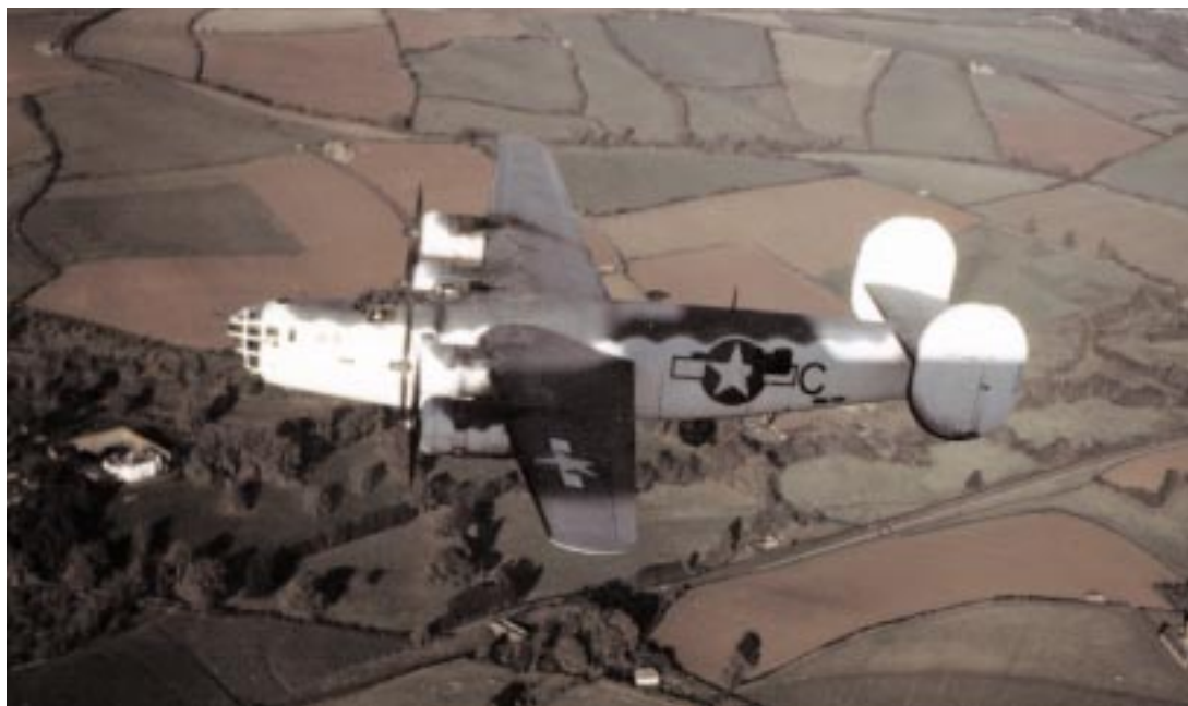
A PB4Y-1 flying over the English countryside en route to a mission over the Bay of Biscay, circa 1943, 80-G-K-14056.

10 Nov 1943: VB-105 was a participant in one of the longest surface battles of aircraft against a U-boat in WWII. At 0800, a VB-105 aircraft piloted by Lieutenant L. E. Harmon, was alerted by an RAF aircraft of a radar contact near the coast of Spain. Harmon located the surfaced U-966 , Oberleutenant Eckehard Wolf commanding and made two strafing attacks. Heavy AA fire damaged his aircraft and forced him to break off the attack. An RAF fighter then dove to attack the submarine. Harmon made a third strafing attack but had to break off afterwards due to a fuel shortage. Lieutenant K. L. Wright, of VB-103, located U-966 near Ferrol at 1040 and delivered a strafing and depth charge attack. Intense AA fire drove him off and he had to depart the target due to lack of fuel. Lieutenant W. W. Parish and crew then arrived on the scene. A depth charge attack was conducted in cooperation with a rocket-firing RAF Liberator at 1230. The submarine was abandoned by its crew after running aground at Oritiguiera, Spain, with eight of its crew of 49 killed in action. The German crewmen were quickly picked up by nearby Spanish fishing vessels and interned by the Spanish government.