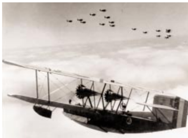
A squadron PD-1 in flight with a formation of fighter aircraft in the upper part of the photo.