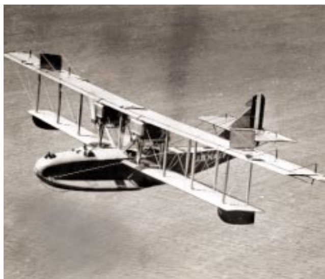
An F-5L in flight.

20 May 1925: VP-10 received new HS-2L flying boats to replace the WWI vintage F-5L and H-16