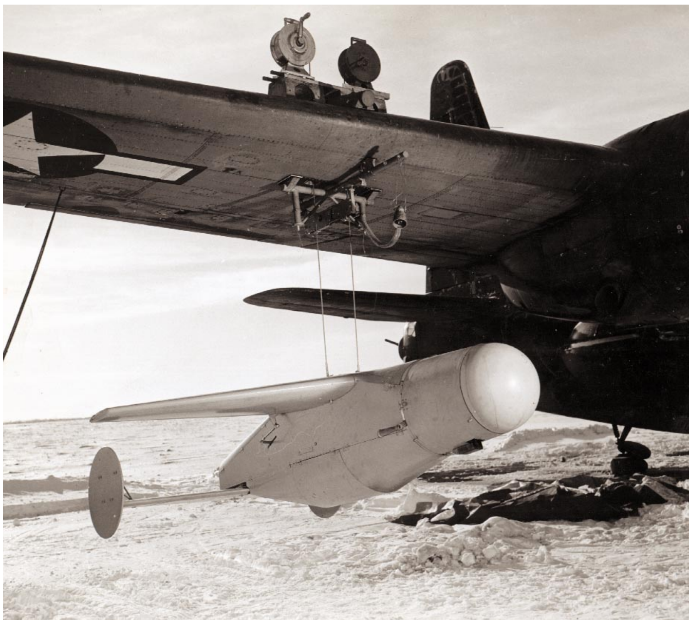
The squadron used Bat missiles in the Pacific during the latter part of the war. This photo shows a Bat missile being placed in position on a PB4Y.