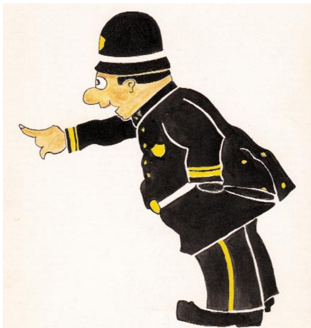
The squadron's well-known insignia.

The first squadron insignia appeared after its redesignation from VP-2D15 to a patrol squadron of the Scouting Fleet in 1931. It is possible the squadron may have used the insignia prior to 1931 and maybe even as far back as 1924. VP-2, in line with its function in the fleet, adopted the insignia of a patrolman chasing an unseen wrongdoer. Colors: hat, black with yellow badge and white band; face, shaded pink; eye, white