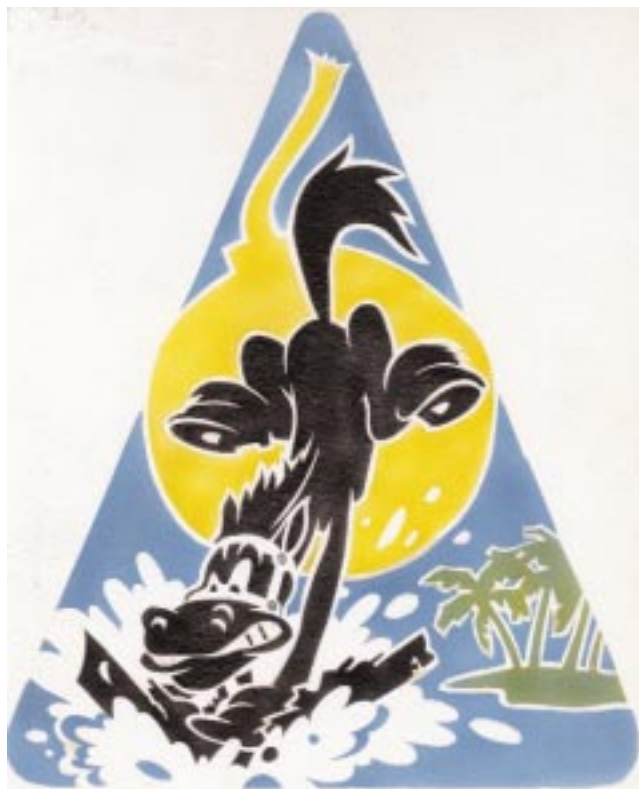
The squadron's Disney designed insignia.

The squadron utilized one of the Walt Disney designs for its insignia. After obtaining the copyright re-