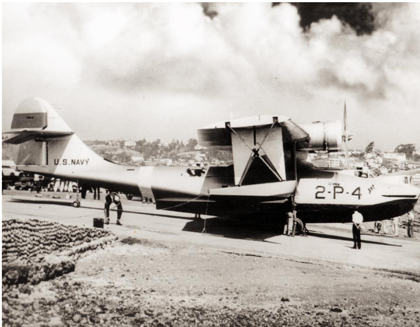
A squadron PBY-2 with the policeman insignia on the bow.