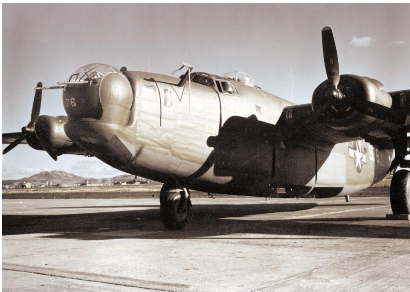
A PB4Y-2 at NAAS Camp Kearney, December 1944, 80-G-K-2678.

1 Apr 1945: VPB-109 was selected to employ the SWOD Mark 9 (Bat) guided bomb. The Bat guided missile was in essence a bomb with wings and control surfaces guided to its target by a mother ship. The Germans had successfully employed similar ordnance in the Mediterranean with great effect. The Bat offered the advantage of being a standoff weapon that allowed the bomber crew to remain out of effective AA range of a surface target while launching the winged bomb at the vessel. The Bat could guide itself to its target by means of target echoes of pulsed microwave radiation emitted by the missile's built-in radar system.