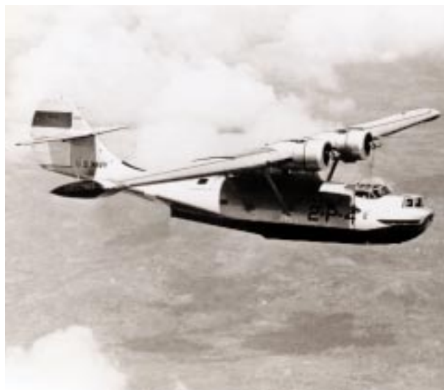
A squadron PBY-2 in flight.

9 Mar–1 Apr 1940: VP-31 was assigned to Neutrality Patrols, operating in conjunction with VP-53 out of NAS Key West, Fla. After the invasion of Poland on 3 September 1939, President Roosevelt declared the neutrality of the United States and directed the Navy to begin a Neutrality Patrol in the Atlantic. It extended