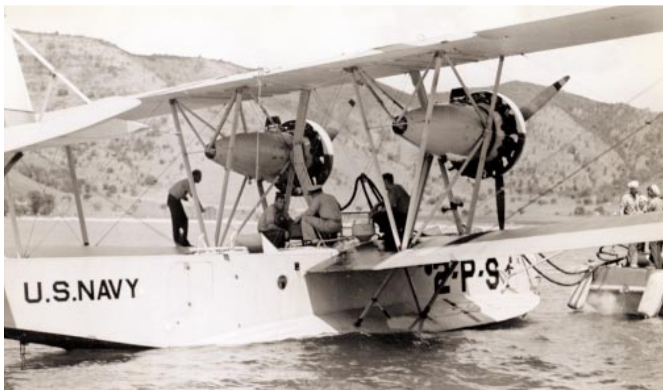
A squadron PM-2 being refueled at Saint Thomas, Virgin Islands, 1937.