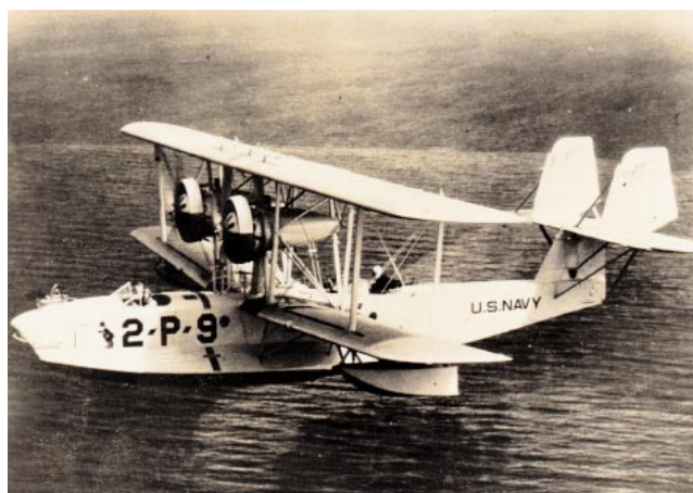
A squadron PM-2 in flight, note the policeman insignia on the bow.

3 Apr 1931: Elements of VP-2D15 completed participation in Fleet Problem XII with Carrier Division One, while VP-8S and VP-10S held off the coast of Guantanamo, Cuba. VP-2D15 aircraft operated from the naval base, while VP-8S was supported by Wright (AV 1) and VP-10S had support from Swann (AM 34) and Whitney (AD 4). The squadron’s 700-mile return flight to Coco Solo, C.Z., took 8 hours and 5 minutes.