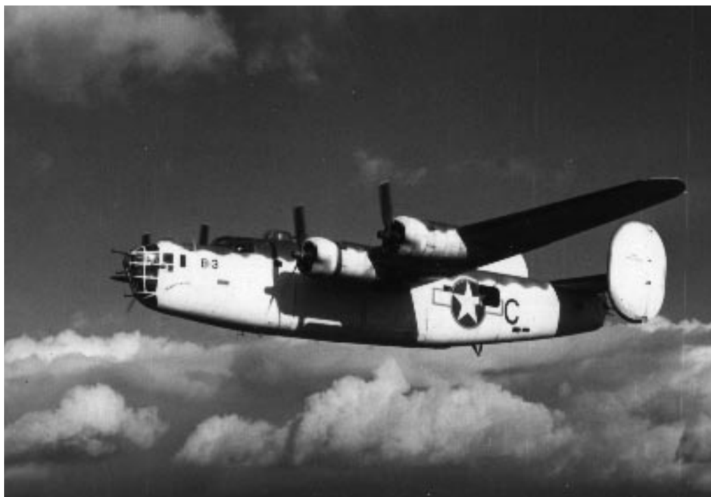
A PB4Y-1 flying over England en route to a patrol over the Bay of Biscay, November 1943, 80-G-407694.