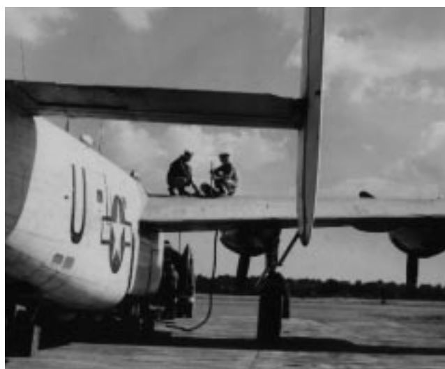
A PB4Y-1 being refueled for a mission, September 1944, 80-G-282241.