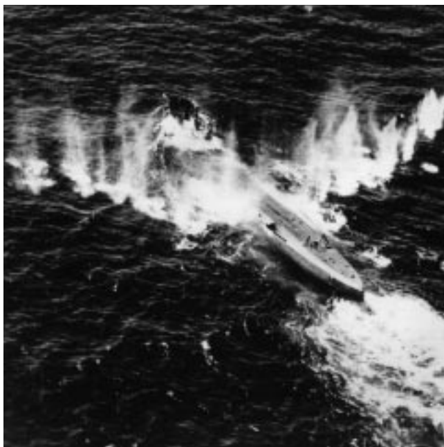
A squadron attack against a U-boat on 3 July 1943. The attack did not result in the sinking of the submarine, 80-G-451454a.

Field, Bermuda, for operational long-range training flights.