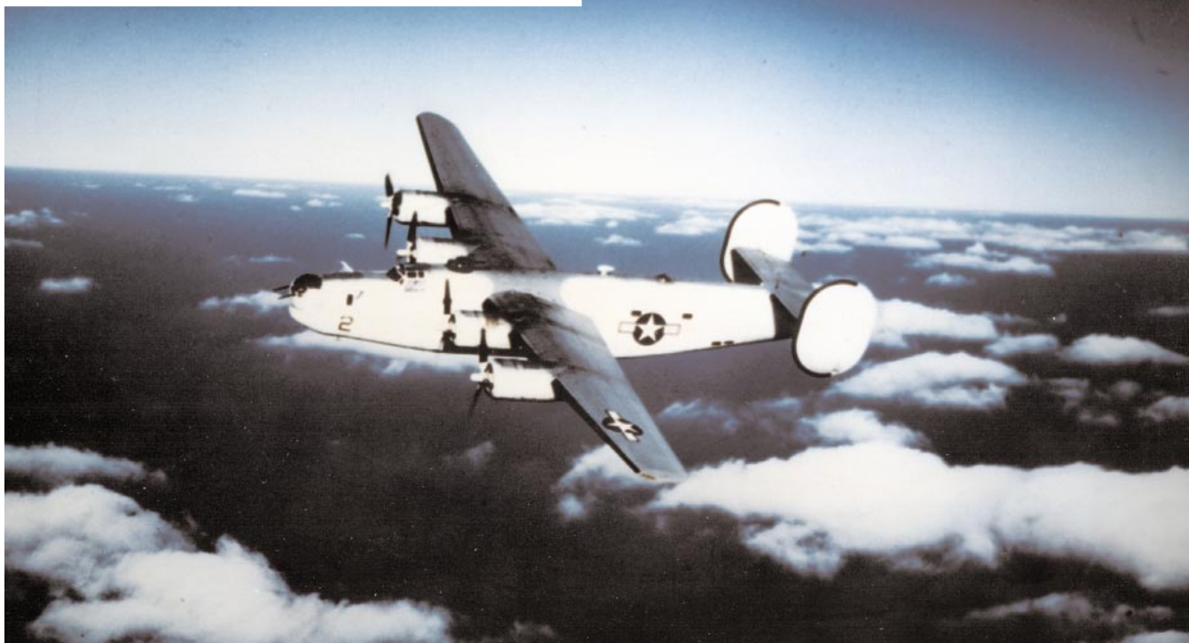
A PB4Y-1 on patrol, 80-G-K-5175.