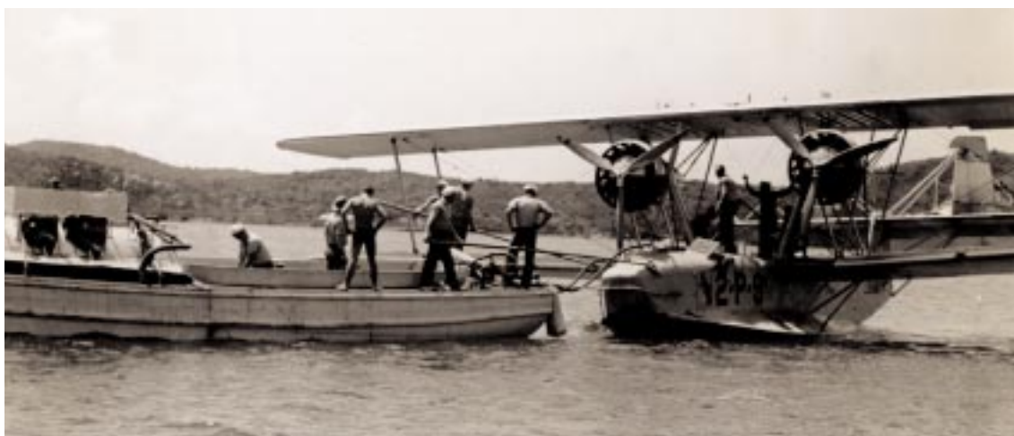
A squadron PM-2 being refueled at Saint Thomas, Virgin Islands, March 1937, note the policeman insignia on the bow.