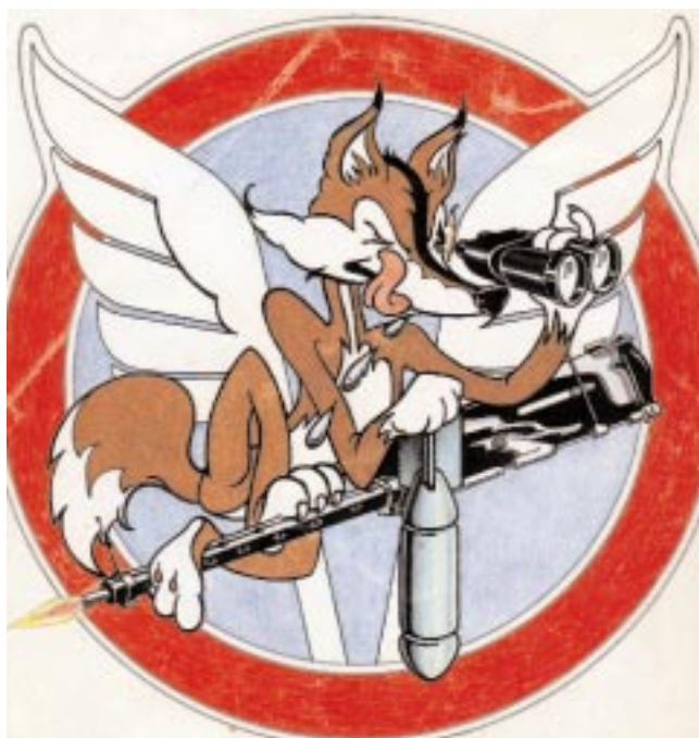
The squadron's cartoon design insignia.

The insignia for VPB-110 was approved by CNO on 3 February 1945. A fox holding a pair of binoculars in his left paw and a bomb in his right straddled a 50-cal-