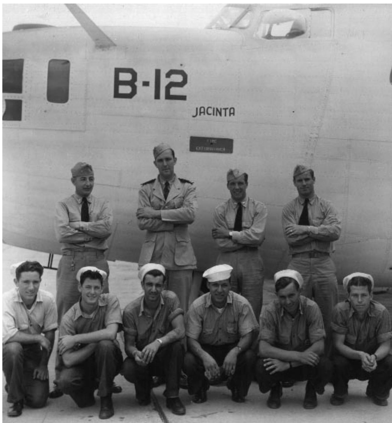
Crew members in front of their PB4Y-1, Quonset Point, 17 June 1943, 80-G-383758.

der of the squadron arrived at NAS Elizabeth City, N.C., for training in operation of the new PB4Y-5A.